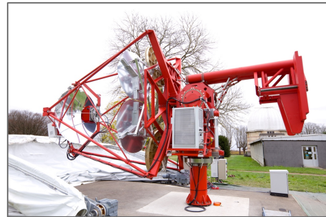
FIGURE 1: GCT Prototype

Paris, France – On 26 November 2015, a prototype telescope proposed for the Cherenkov Telescope Array, the Gamma-ray Cherenkov Telescope (GCT- Figure 1), recorded CTA’s first ever Cherenkov light while undergoing testing at l’Observatoire de Paris in Meudon, France. The GCT is proposed as one of CTA’s small size telescopes (SSTs), covering the high end of the CTA energy range, between about 1 and 300 TeV (tera-electronvolts). Another SST prototype, the ASTRI telescope, captured the first optical image in May 2015 with its diagnostic camera.