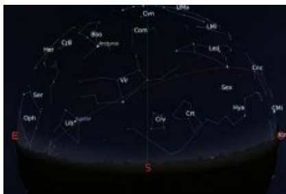
Carte du ciel en direction sud - mai 2018