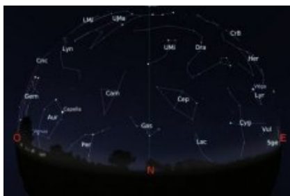
Carte du ciel en direction nord - mai 2018

These sky maps show the bright stars and planets visible from the northern hemisphere, looking South and North, on may 15th 201 ! (23h). The vertical line corresponds to the projection on the sky of the local meridian. The red arc on the Southern horizon represents the ecliptic (the annual path of the Sun).