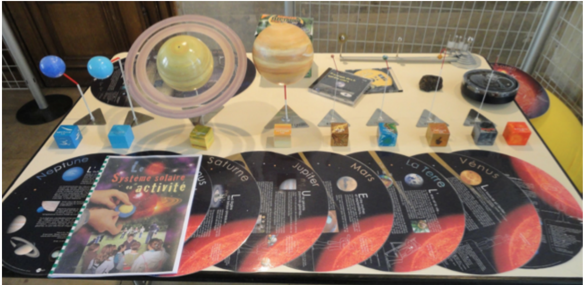
Mallette pédagogique "Système Solaire" UFE - Observatoire de Paris

Advisors from the Observatoire have at their disposal pedagogical "suitcases"; they can give scientific help and advice either directly at school or by telephone or email. .