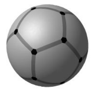
Figure 1: Left : Poincaré Dodecahedral Space can be described as the interior of a spherical dodecahedron such that when one « goes out » from a pentagonal face, one « comes back » immediately inside the space

Motivated by indications that the Universe may have positive curvature, and calculating large-angle vibrational harmonics to simulate the power spectrum, some authors of the present study [ref. 2] had already argued in October 2003 that the multiply-connected Poincaré dodecahedral space (PDS) topology was favoured by the WMAP data relative to an infinite, simply connected flat space.